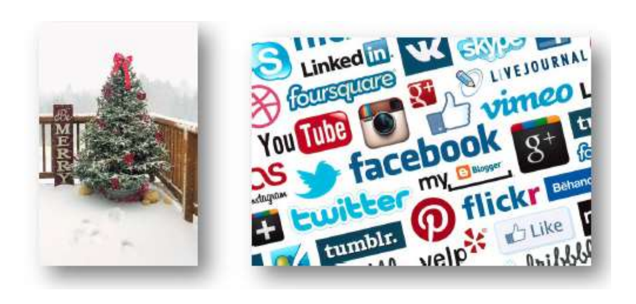
Task 3: Engage a short conversation with another candidate, asking her/him a few questions and answering hers/his. E.g.: What would make a job interesting for you? Would you like to live in the same place for a long time? Do you prefer to go out with your friends or with your family?

Task 2 : You will be shown a couple of pictures and you will be asked to tell something about them E.g.: a picture of a Christmas tree: who do you usually spend your holidays with? Tell me about atypical celebration or festival in your Country. A picture of social media logos: How often do you use the Internet? Do you think some social media apps, such as TikTok or Instagram, can influence teenagers? Why?